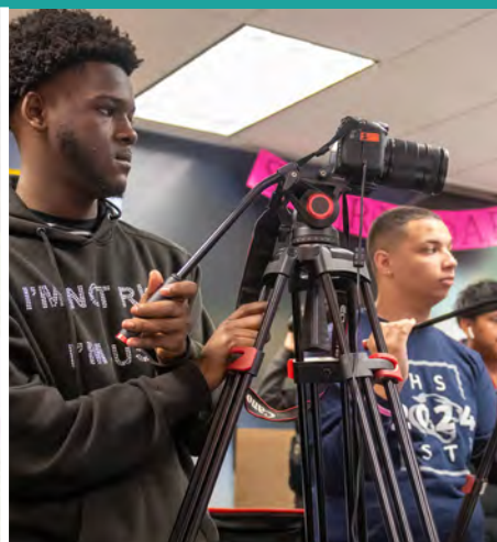
Career change, Page 9