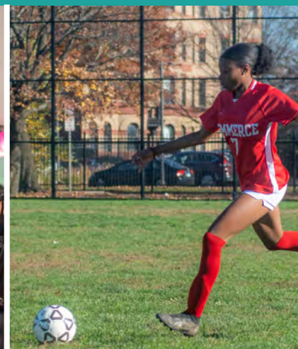
Century mark, Page 12