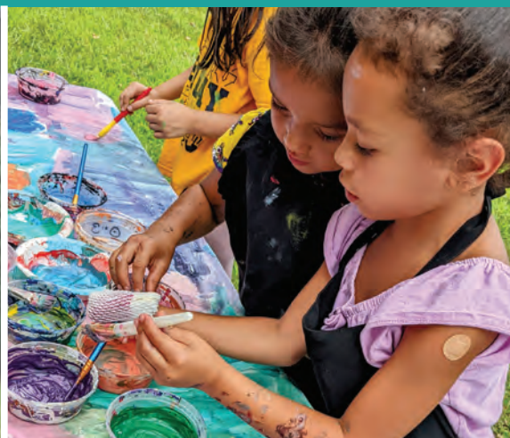
Art is alive, Pages 6-7