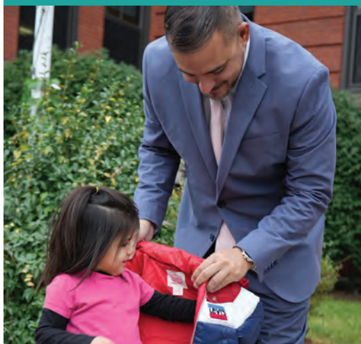
Family man, Page 4